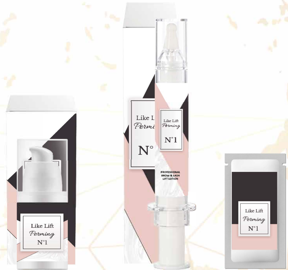
Pump Airless 10ml