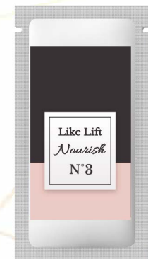
Box of 10 sachets of 0.8ml