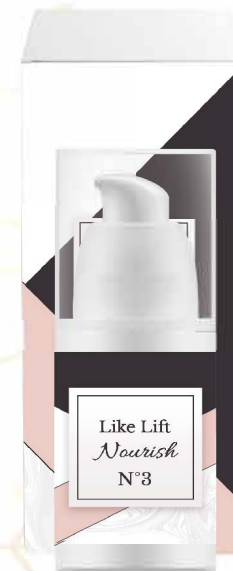
Pump Airless 5ml